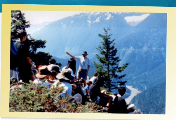
Students learn about the history of British Columbia from a vantage point on the HBC fur brigade trail in the Fraser Canyon.